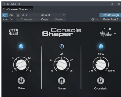
Figure 2: Console Shaper Plug-in Controls

Presonus Console Shaper plug-in is the first Mix FX plug-in (included with Pro) which include a "Mix Processor" per channel associated with the bus and a "Sum Processor" with central controls packaged inside a single plug-in. Both Processors include a "State Space" model of analogue Pre-Amp and Auto Leveling circuits as well as control over noise and cross-talk artifacts associated with the circuitry. Drive, Noise and Crosstalk artifacts have the ability to be switched in or out of the emulation allowing for maximum flexibility, however other subtle console characteristics are always present if the Console Shaper is applied to the bus.