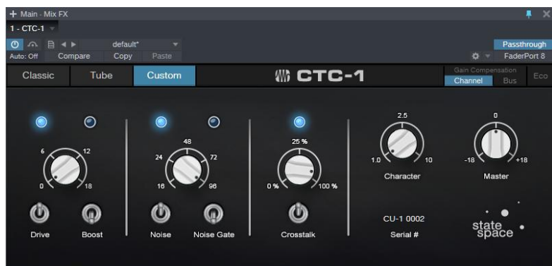
Figure 3: Example of the additional or enhanced controls on the CTC-1

In addition to the CTC-1 plugins modeling two classic consoles and one custom summing engine it also has additional controls allowing more control and flexibility of gain, noise, auto-gain behavior and CPU consumption. This is the second Presonus plug-ins offered using the Mix FX protocol.