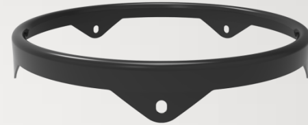
City EZ Curve