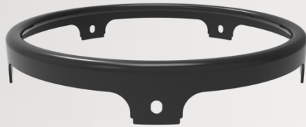
Aspire EZ Curve